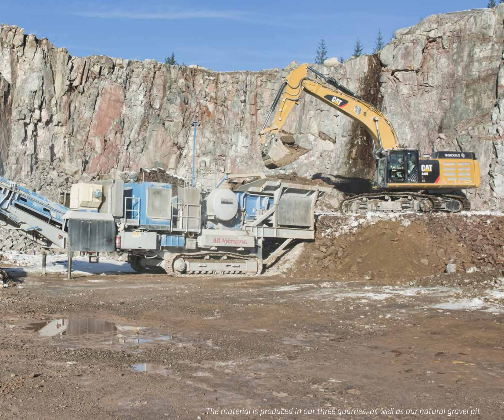
The material is produced in our three quarries, as well as our natural gravel pit.